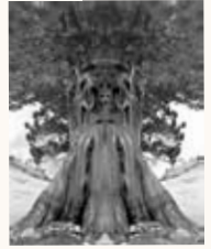
Jerry Uelsmann (b. 1934), Tree Goddess , 1994. Silver gelatin print, 16"x20." Museum of the American West Collection, Autry National Center, Los Angeles.

Yosemite: Art of an American Icon was organized by the Museum of the American West, Autry National Center, Los Angeles, California.