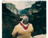
Roger Minick (b. 1944), Yosemite National Park , 1980. Dye coupler print, 16"x20." Oakland Museum of California Prints and Photographs Fund.