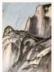
Chiura Obata (1885-1975), "Half Dome," 1927. Sumi and watercolor on paper. Private collection.