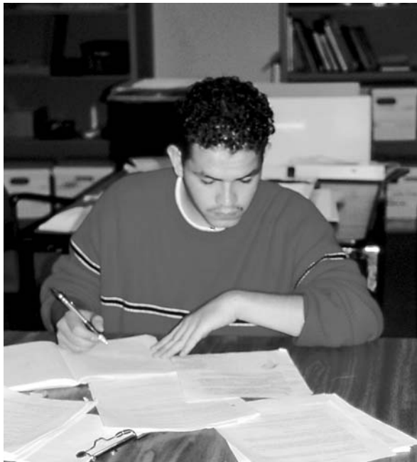
REVIEWING ORAL HISTORY INTERVIEW NOTES AND TRANSCRIPTS, A YOUTH HISTORIAN CONSTRUCTS A WRITTEN NARRATIVE.

4. As a wrap-up, ask youth historians to reflect on this topic in their journals: Given your specific topic, what do you need to keep in mind about your audience? Think in terms of content, writing, knowledge, design, and presentation. How will you continue to attempt to convey/communicate the key points of your research focus?