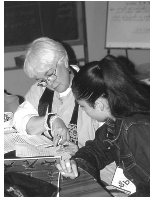
A YOUTH HISTORIAN AND EDUCATOR EDIT WORK TOGETHER.

Youth historians will be engaging in multiple editing phases of their writing known in education circles as the “writing process.” This process will take place over the course of a number of days, and will involve a great deal of writing. The youth historians now have the first draft of the writings for their culminating project. This is the time the editing process begins.